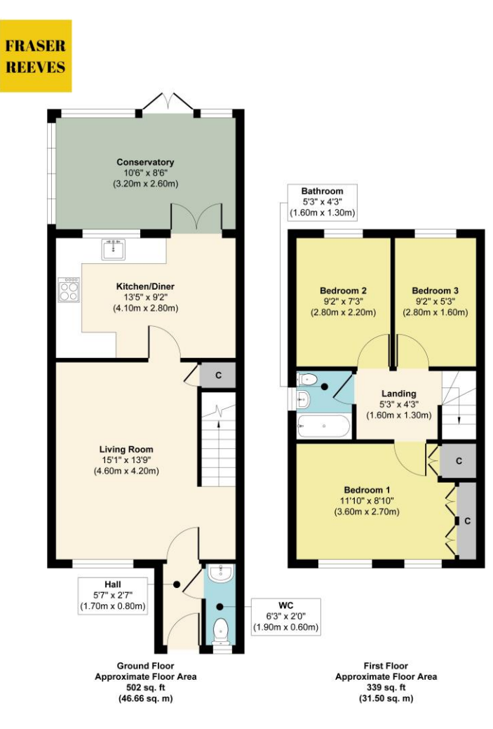
Approx. Gross Internal Floor Area 841 sq. ft / 78.16 sq. m Illustration for identification purposes only, measurements are approximate, not to scale. Produced by Elements Property